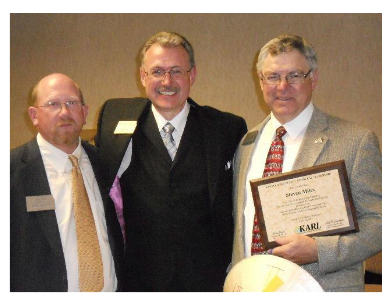
WE ARE... DEVELOPING LEADERSHIP EXCELLENCE!

Class X has now graduated and will move on to do great things. So if you thought this is the end you are quite mistaken...it just the beginning. Our next phase of learning is in the KARL Graduate Program for the rest of our lives.